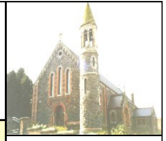
Our Lady of Lourdes